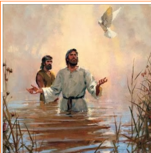
The Baptism of the Lord, celebrated on Monday, January 8, 2023.